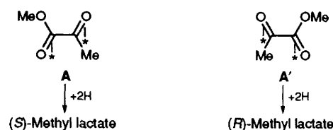
Fig. 1 The conversion of adsorbed methyl pyruvate (A and its mirror image A') by hydrogen addition to the two enantiomers of methyl lactate