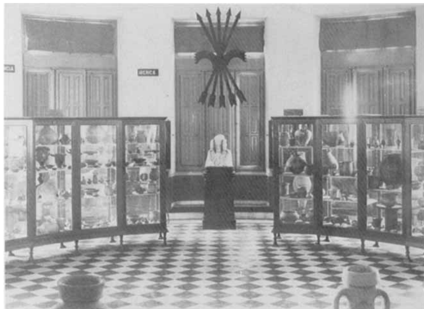
FIGURE 5. Archaeological Provincial Museum of Alicante after the Spanish Civil War. (Museo Arqueológico Provincial de Alicante.)

cia, inhabited by Ilergetes, Ilercavones and Edetani. From an ethnical point of view Bosch-Gimpera identified these people with the Iberians.