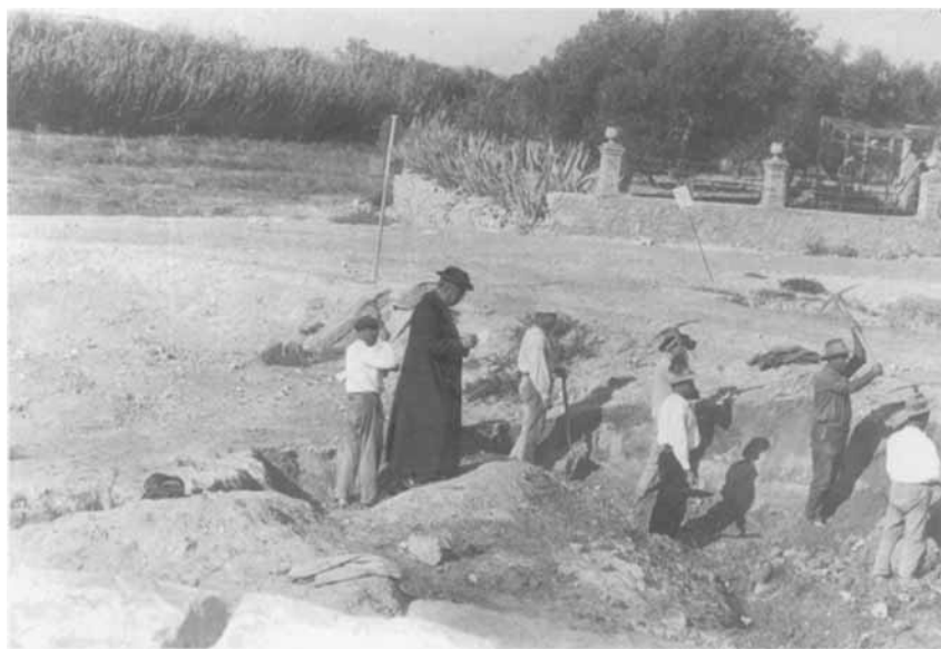
FIGURE 3. Excavations in Tossal de Manises and Albufereta, 1932, Alicante, Spain. (Institut d'Estudis Catalans.)

In the first phase of nationalization, there was opposition in the Cortes of Cádiz between two points of view: the unitarist position, which saw the territory of the Peninsula as one unit, was opposed by the municipalist, decentralized, federal position. The second phase of nationalization, in the mid 19th century, is best reflected by the 1845 Constitution, showing a triumph of the centralist position and single national identity, with limitations to popular sovereignty. It was around this time that Modesto Lafuente published the Historia General de España . In this work he proposed a new myth to explain the origins of the Spanish character, calling on a mixture of Iberians and Celts: the Celtiberians (Lafuente 1850).