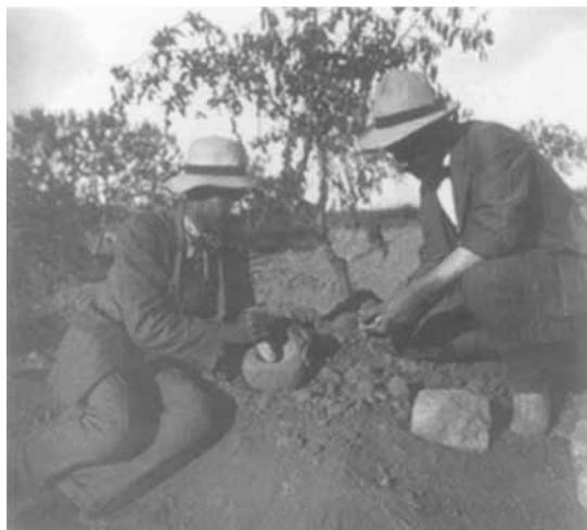
FIGURE 2. Excavation in Tossal de les Tenalles, 1915, Sidamunt, Lleida, Spain.