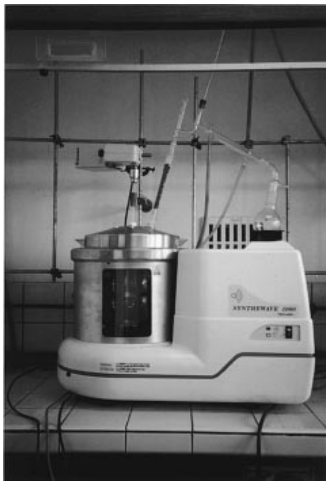
Figure 1. Photograph of Synthrowave 1000 apparatus as it is used.

To scale-up these syntheses, we used a Synthrowave 1000 apparatus 6 fitted with a 1-L quartz reactor, a mechanical stirrer, and a glass helices-packed column (15 cm long, 1 cm diameter), as shown in Figure 1.