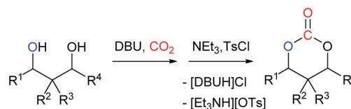
Scheme 1 Strategy for the synthesis of cyclic carbonate from 1,3-diols and CO 2 (R 1 –R 4 are the various substituents of 1,3-diols used, see Table 2).

Herein, we report a safe and efficient one-pot procedure for the synthesis of 6-membered cyclic carbonates directly from 1,3-diols, which uses CO 2 as the carbonation agent instead of phosgene derivatives. This methodology proceeds at room