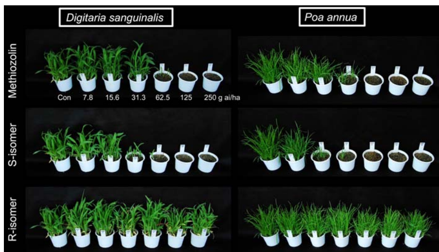
Figure 2. Herbicidal activities of racemic methiozolin and enantiopure isomers toward Digitaria sanguinalis and Poa annua .

3-Methyl-2-thiophenecarboxaldoxime (2). Freshly distilled 3-methyl-2-thiophenecarboxaldehyde (126.0 g, 1.0 mol) was dissolved in methanol/water solution (200 mL/150 mL), and hydroxylamine hydrochloride (76.5 g, 1.1 mol) was added during 15 min at 10–15 °C with good stirring. A solution of NaOH (44.0 g, 1.1 mol) in water (50 mL) was added dropwise to the reaction mixture, and it was stirred for an additional 15 min at room temperature. The reaction mixture was concentrated by rotary evaporation to precipitate white crystalline solids. The precipitates were filtered and dried under vacuum to afford 3-methyl-2-thiophenecarboxaldoxime (139.0 g, 98.5%) mp 111.0–112.0 °C; 1 H NMR (500 MHz, CDCl 3 ) \delta 2.44 (s, 3H), 6.95 (d, J = 5.1 Hz, 1H), 7.49 (d, J = 5.1 Hz, 1H), 7.81 (s, 1H); C NMR (75