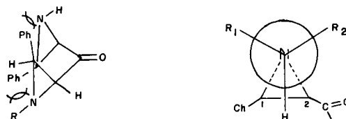
Figure 2. The effect of steric compression shift.

The steric shift of the ring carbons should be most pronounced for N - t -butyl aziridines [15]. The narrow C-N-C bond angle of the aziridine ring imparts a strong conformational preference for the exocyclic N -alkyl substituent. Only the smallest group possible (usually hydrogen) exists gauche to the ring atoms C-1 and C-2 ( cf. Figure 2). The similarity of the chemical shifts of C-1 and C-2 for 5b-d indicates that hydrogen at C \alpha is preferentially in the sterically constrained gauche position, and that the major substituents and N-C \alpha are anti to C-1 or C-2. However, for the N - t -butyl compound, 5a , one methyl of t -butyl must lie in the gauche position, and a substantial steric shift for C-1 and C-2 is then observed ( cf. Table II).