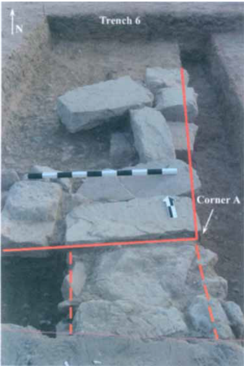
FIGURE 4. Trench 6 excavation showing Corner A of the northern structure (mapped in FIGURE 3). The function of the wall extension below the corner is not known.