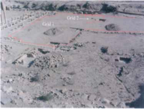
FIGURE 1. GPR grids at the 'Lower Market' site, looking north.

LAWRENCE B. CONYERS, EILEEN G. ERNENWEIN & LEIGH-ANN BEDAL*