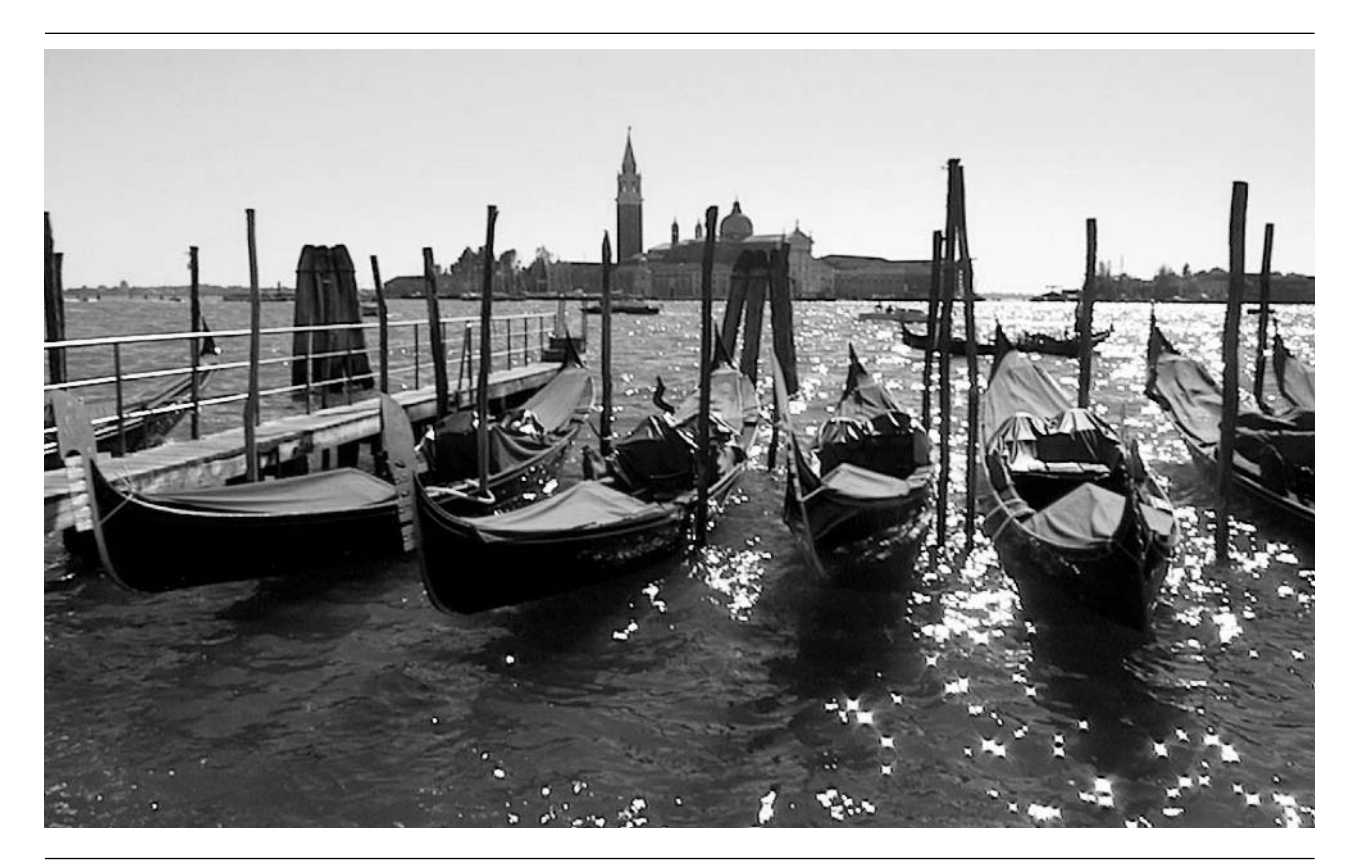
San Giorgio Maggiore - Venice, Italy