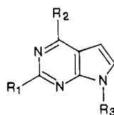
Table I. Antiviral Activity and Cytotoxicity of 4-Substituted and 2,4-Disubstituted 7-[(2-Hydroxyethoxy)methyl]pyrrolo[2,3-d]pyrimidines