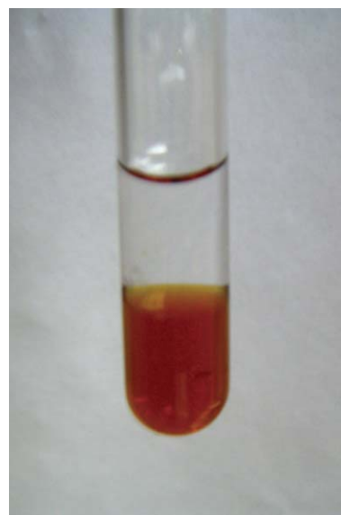
Scheme 2 Immobilized Ir-(P-Phos) catalyst in hexane/DMPEG biphasic system (lower DMPEG phase).

The recyclability of the Ir-catalyst in DMPEG was examined using 1a as the model substrate. Upon completion of the reaction, the product was easily separated via simple decantation and the DMPEG layer was further extracted twice with hexane in air. The DMPEG phase was recharged with 1a and hexane, and then subjected to hydrogenation again under the same conditions. The Ir-(P-Phos) catalyst was reused for eight times with the retention of reactivity and enantioselectivity (Table 2). These results further demonstrated the air-stability of the Ir-(P-Phos) catalyst system. ICP-AES analysis of the hexane extract showed leaching of less than 0.4% of the iridium complex during the extraction of the products.