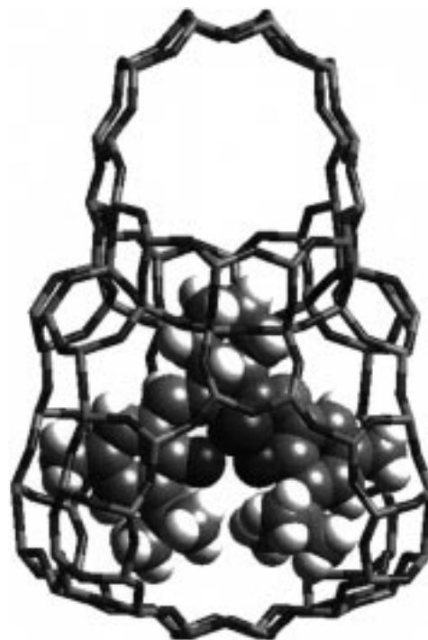
Fig. 1 View of the molecular fit of 1 in EMT (Cerius 2 software)

Electronic absorption spectra in Fig. 2 show ligand transitions of the brownish oxidized complex 1 (in solution) at 322 and 438 nm and a weak d-d transition at 500 nm [Fig. 2(a)]. 10 Upon zeolite encapsulation, the former bands shift to 335 and 422 nm, while the weak d-d transition is still observed at about 500 nm [Fig. 2(b)]. Strikingly, the d-d transition at 500 nm characteristic for Mn III in these complexes is absent in the spectrum of 3 -EMT [Fig. 2(c)], with bands at 266, 333 and 438 nm. In the IR spectrum (not shown), we observe the imine band at 1638 cm -1 and a mode at 1458 cm -1 for the salen ligand of 1 , assembled in the zeolite and dehydrated at 110 °C ( 10^{-5} Torr)