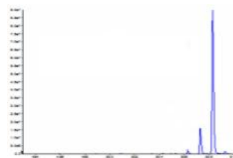
Figure 1: Enhanced resolution scan of [ 13 C 15 ]-T-2 tetraol for determination of isotope pattern